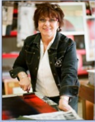
Author's photo, 2012